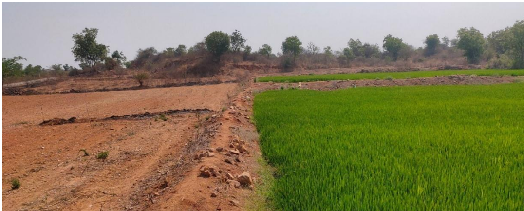
Fig. 1. Non-traditional areas and wastelands brought into rice cultivation in Telangana (location: Thimmajipet Mandal, Mahabubnagar)

Rice is one of the main food crops in Telangana. After the state was formed in 2014, major irrigation projects helped farmers grow rice on a much larger scale. The area under