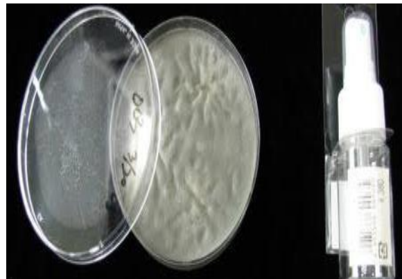
Fig. Testing for air borne disease in Magnaporthe oryzae

To check whether resistance from parents to offspring in case of air borne, spray the conidial suspension on the plants. If they showed the less disease severity indicates presence of resistance in plants and more disease severity indicating susceptibility to pathogen.