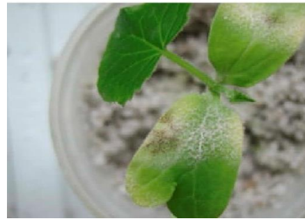
Fig. Testing for seed borne disease in powdery mildew