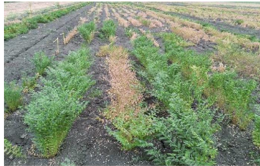
Fig. Testing for soil borne disease

For example, inoculate the wilting pathogen Fusarium oxysporum in the field. Sow the progeny of the parents in field. If the plants showed the symptoms of wilting there are susceptible to disease and no symptoms indicates resistance in the plants.